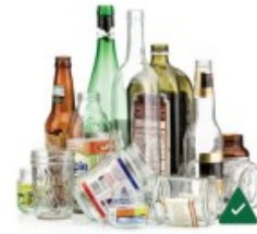
Glass Bottles & Jars Botellas y envases de vidrio