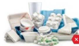
NO Foam Cups & Containers NO vasos y recipientes de poliestireno