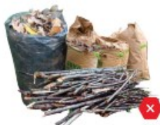
NO Green Waste NO desechos verdes