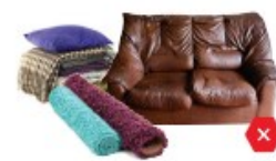
NO Clothing, Furniture & Carpet NO ropa, muebles y alfombras