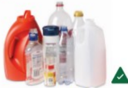
Plastic Bottles & Jugs #1, 2 & 5 ONLY Las botellas y jarras de plástico