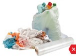
NO Loose Plastic Bags, Bagged Recyclables or Film Empty recyclables directly into your cart NO bolsas y envolturas de plástico sueltas, o materiales reciclables embolsados. Vacíe directamente los materiales reciclables en nuestro carrito