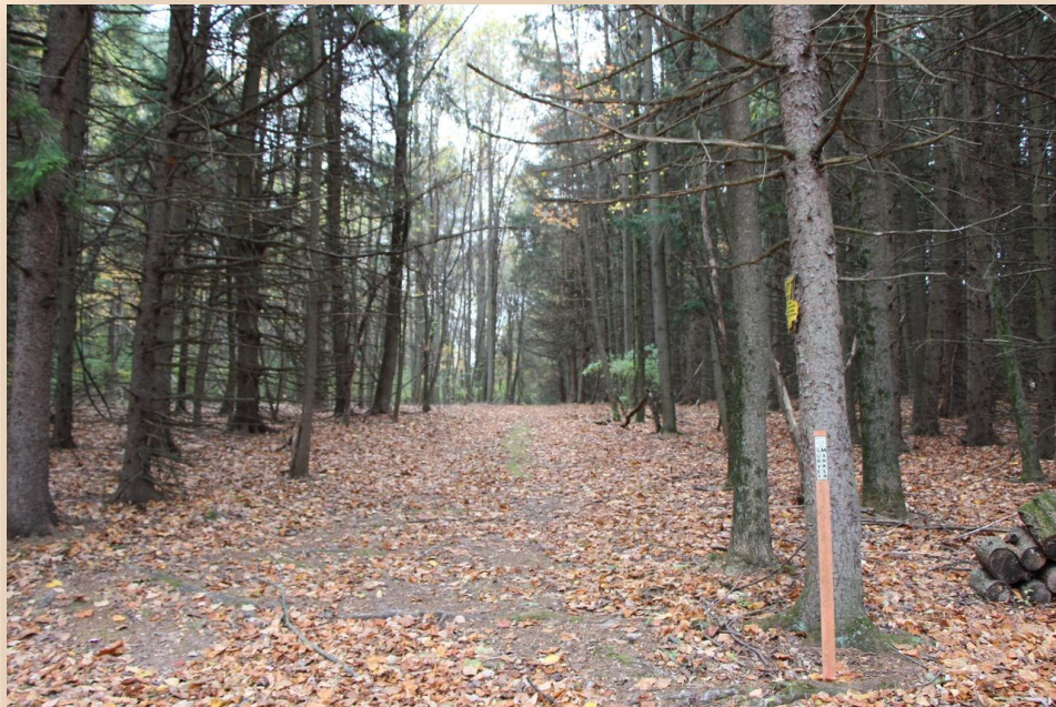
Above - Detweiler Park, Dauphin County

Luckily, you don't have to go very far to get a daily dose of Vitamin Tree, from you own backyard to the several Parks and trails located in Middle Paxton Township.