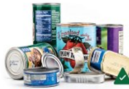
Food & Beverage Cans Latas de alimentos y bebidas