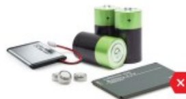
NO Batteries Check local drop-off programs for proper disposal NO baterías - Verifique los programas locales de entrega para su correcta eliminación