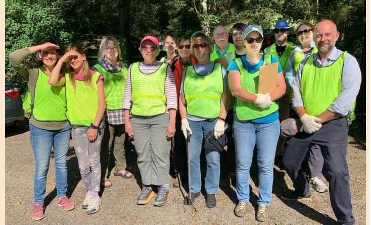
Above: 22nd Trash Collection session! We had a WONDERFUL Adopt-a-Highway Trash Pickup on June 4, 2022! Photo Credit: CCWPA. ALL RIGHTS RELEASED.

For information about the Clarks Creek watershed, general information on watershed protection, links to other Watershed Preservation associations and water protection groups, and details about the activities of CCWPA, please visit our Facebook page at https://www.facebook.com/CCWPA or our website at https://ccwpa.org .