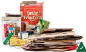
Flattened Cardboard & Paperboard Cartón y cartulina aplastados