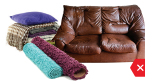
NO Clothing, Furniture & Carpet NO ropa, muebles y alfombras