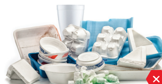
NO Foam Cups & Containers NO vasos y recipientes de poliestireno