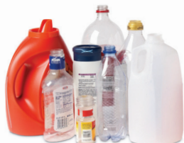
Plastic Bottles & Jugs #1, 2 & 5 ONLY Las botellas y jarras de plástico