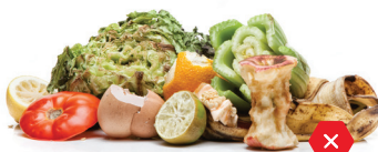
NO Food or Liquids NO comida o líquidos