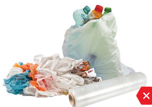
NO Loose Plastic Bags, Bagged Recyclables or Film Empty recyclables directly into your cart NO bolsas y envolturas de plástico sueltas, o materiales reciclables embolsados. Vací directamente los materiales reciclables en nuestro carrito