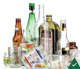
Glass Bottles & Jars Botellas y envases de vidrio