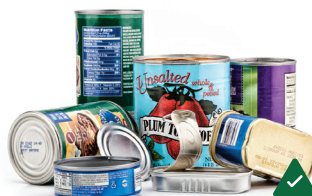
Food & Beverage Cans Latas de alimentos y bebidas