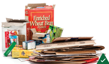
Flattened Cardboard & Paperboard Cartón y cartulina aplastados