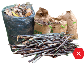
NO Green Waste NO desechos verdes