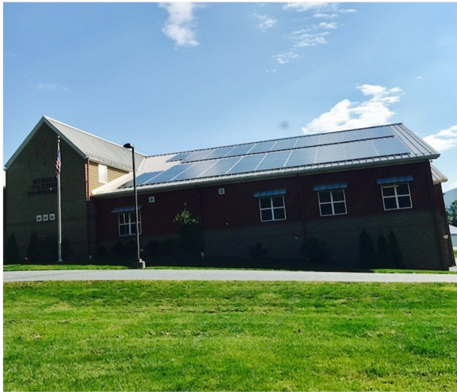
Solar Project at the Middle Paxton Joint Municipal Services Building

If you have any questions on any of the above projects please do not hesitate to contact the Township Manager, 717-921-8128 ext.106